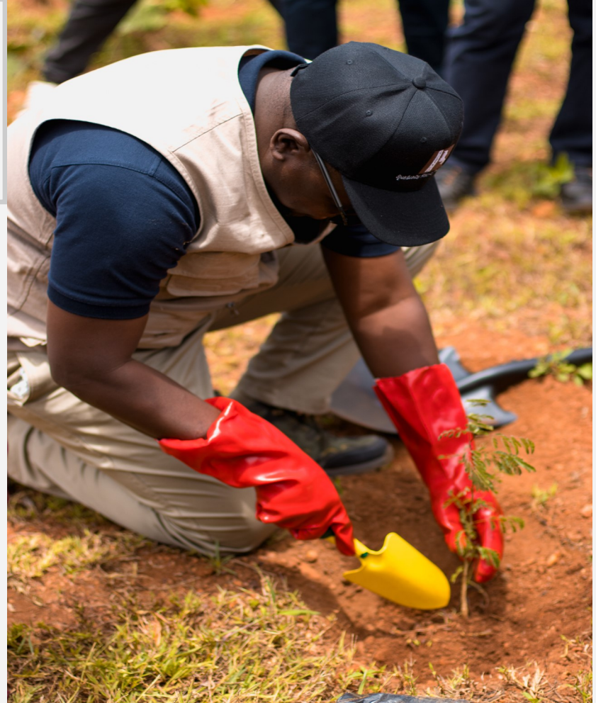
Figure : MUSCCO CEO planting a tree

In the course of the week (1<sup>st</sup>-8<sup>th</sup> March 2024), SACCOs and various networks in the sector took part in Tree planting exercise. Central region SACCOs planted trees at Malingunde Dam, SAC-CO Young Professionals network (Central region chapter) participated in planting trees at LU-ANAR (Bunda Campus) while MUDI SACCO led southern region SACCOs in tree planting at MUDI River, Blantyre. A total of 5,000 trees were planted.