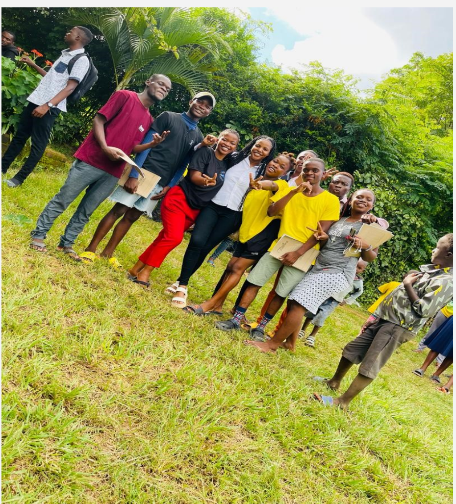
Figure 5: Pose with the SYPN– Southern region Chairperson