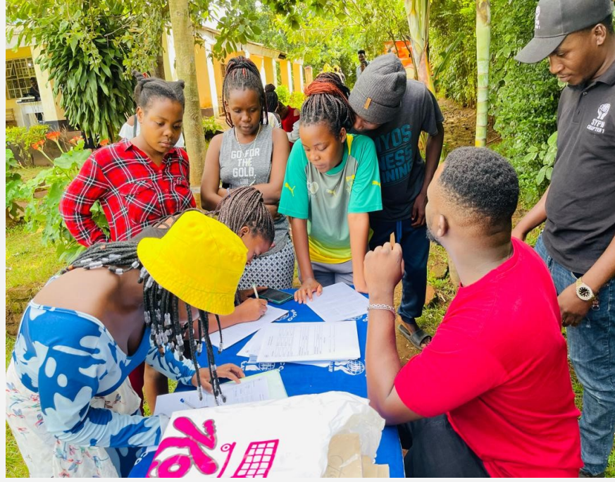
Figure 4:SYPN Representative administering registration

SACCO Young Professionals Network (SYPN- MW) southern region chapter, continues to make headlines with their youth membership mobilisation drive. The team, visited Mulanje Development Institute. While there, SYPN- MW had financial literacy sessions which eventually resulted in the youths joining SACCOs. Indeed, SACCOs are for Everybody!