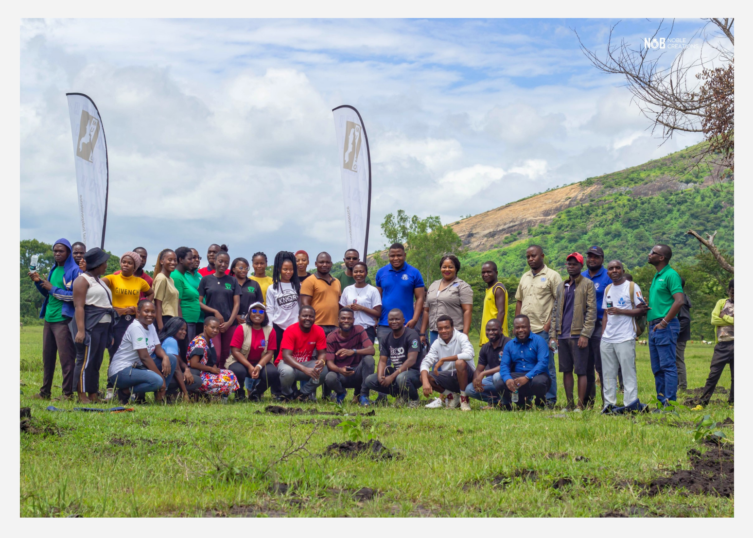
Figure 3: SACCO Young Professionals Network (SYPN) Central Region, planted trees at LUANAR-(Bunda Campus)